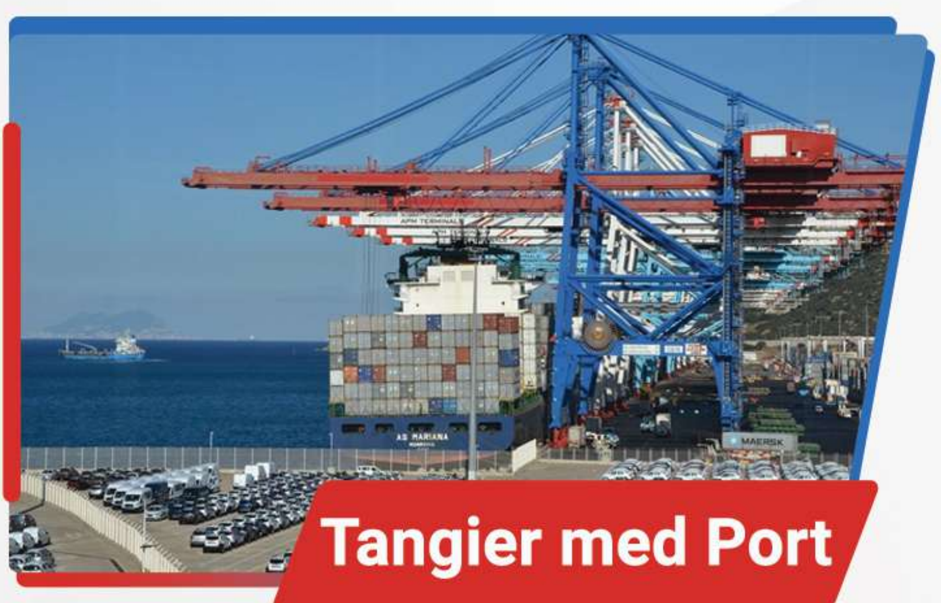
Tangier med Port

Tanger, economic showcase of Morocco Tangier economic managers are very proud of it. The foreign direct investment magazine, a Financial Times publication, ranks the Tangier free zone sixth best zone of the future, first free port zone and second best airport zone in the world. Dakhla will be the first port in Africa The opening of an American consulate in Dakhla will allow the city and by