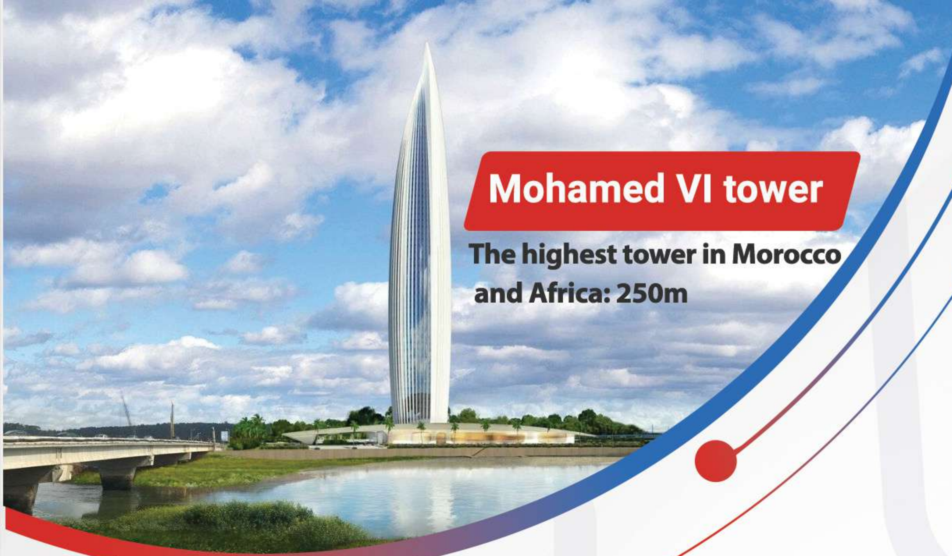
Mohamed VI tower The highest tower in Morocco and Africa: 250m