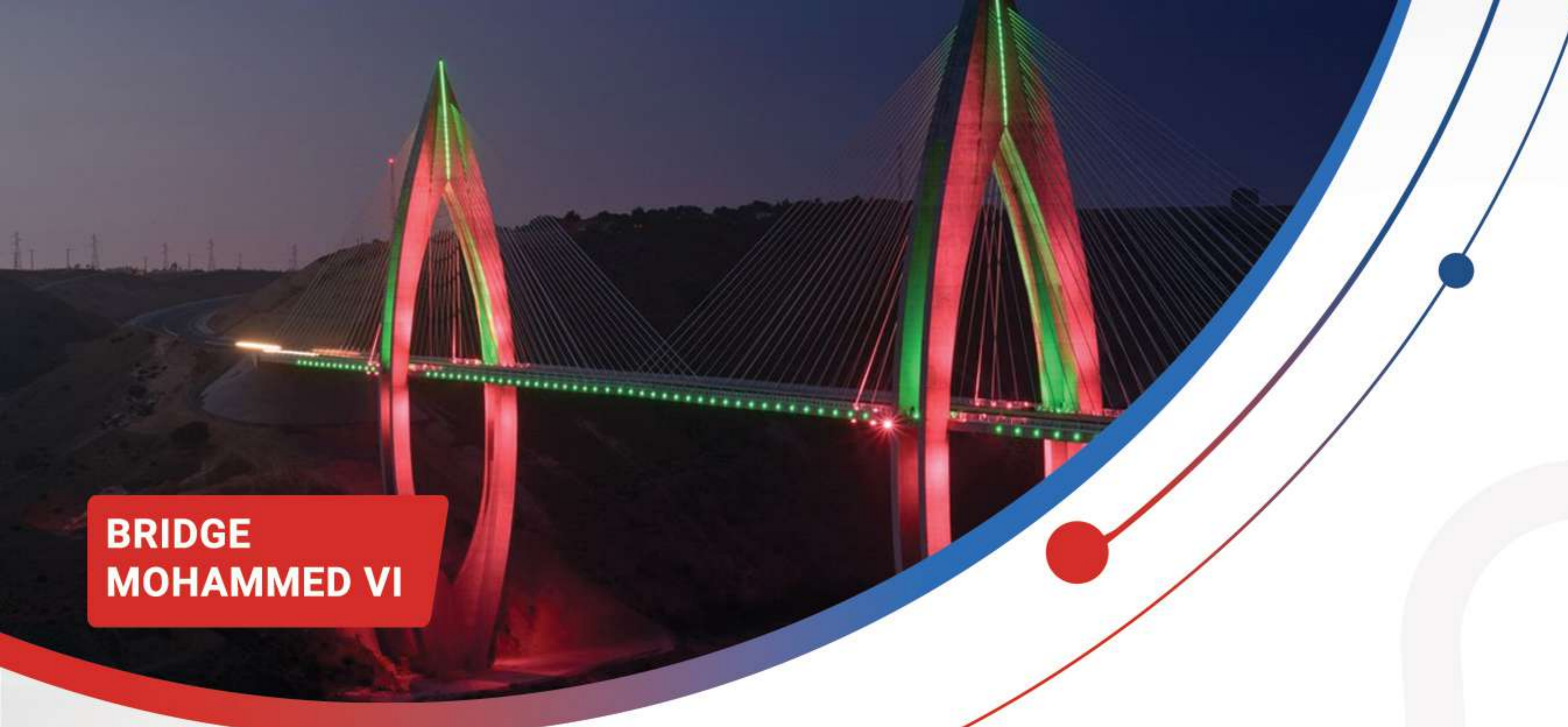
BRIDGE MOHAMMED VI