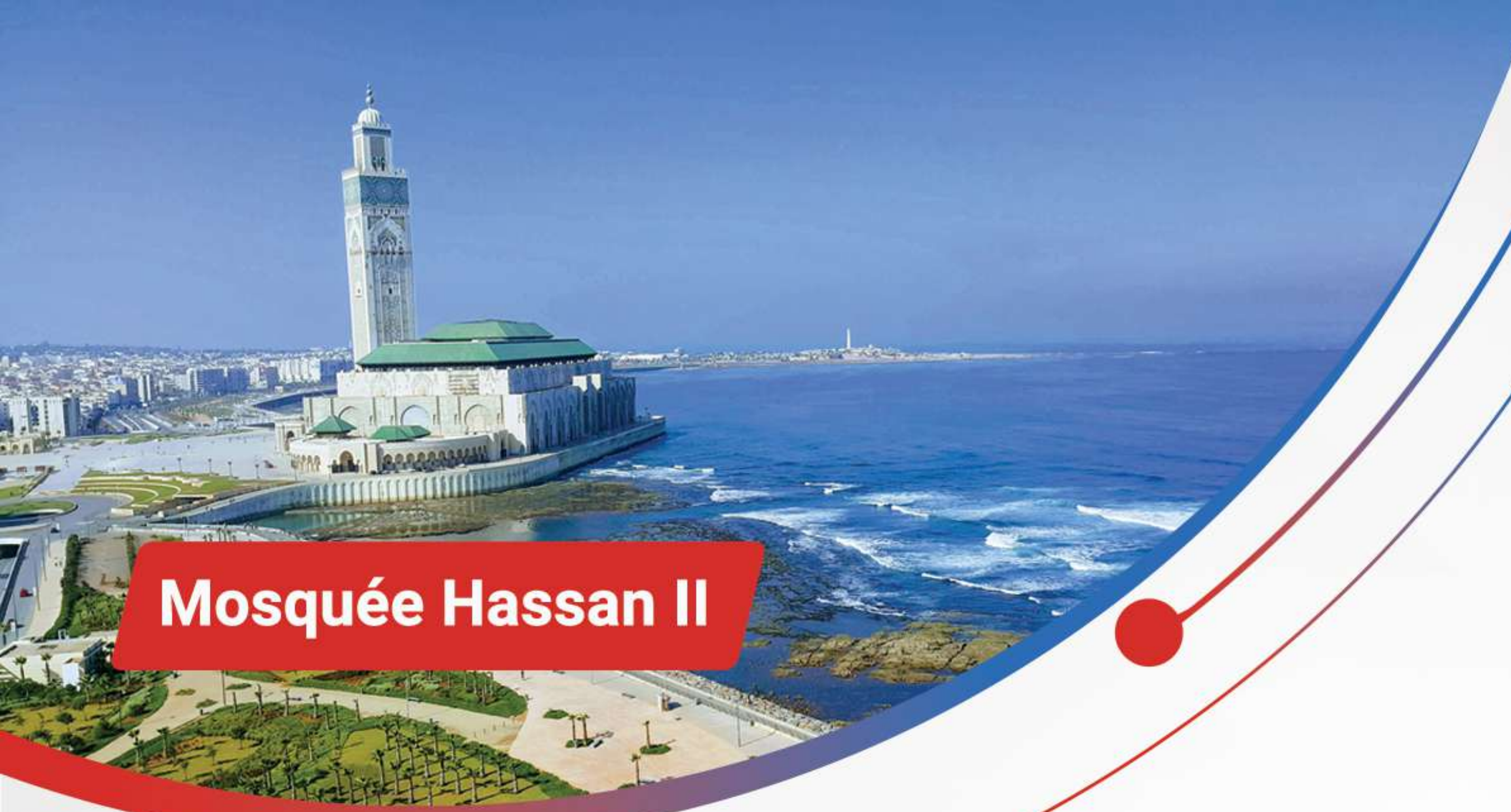
Mosquée Hassan II