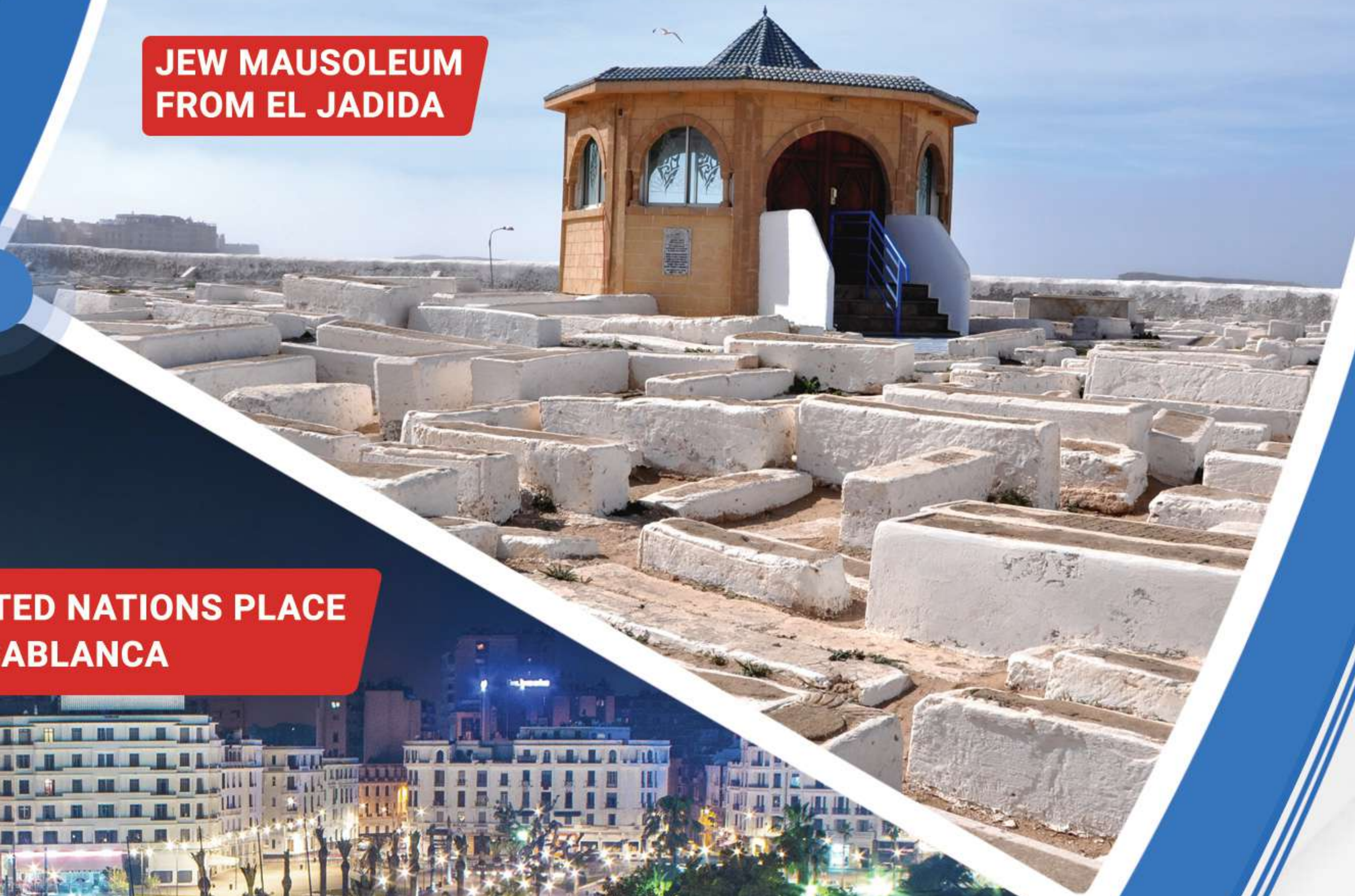
UNITED NATIONS PLACE CASABLANCA