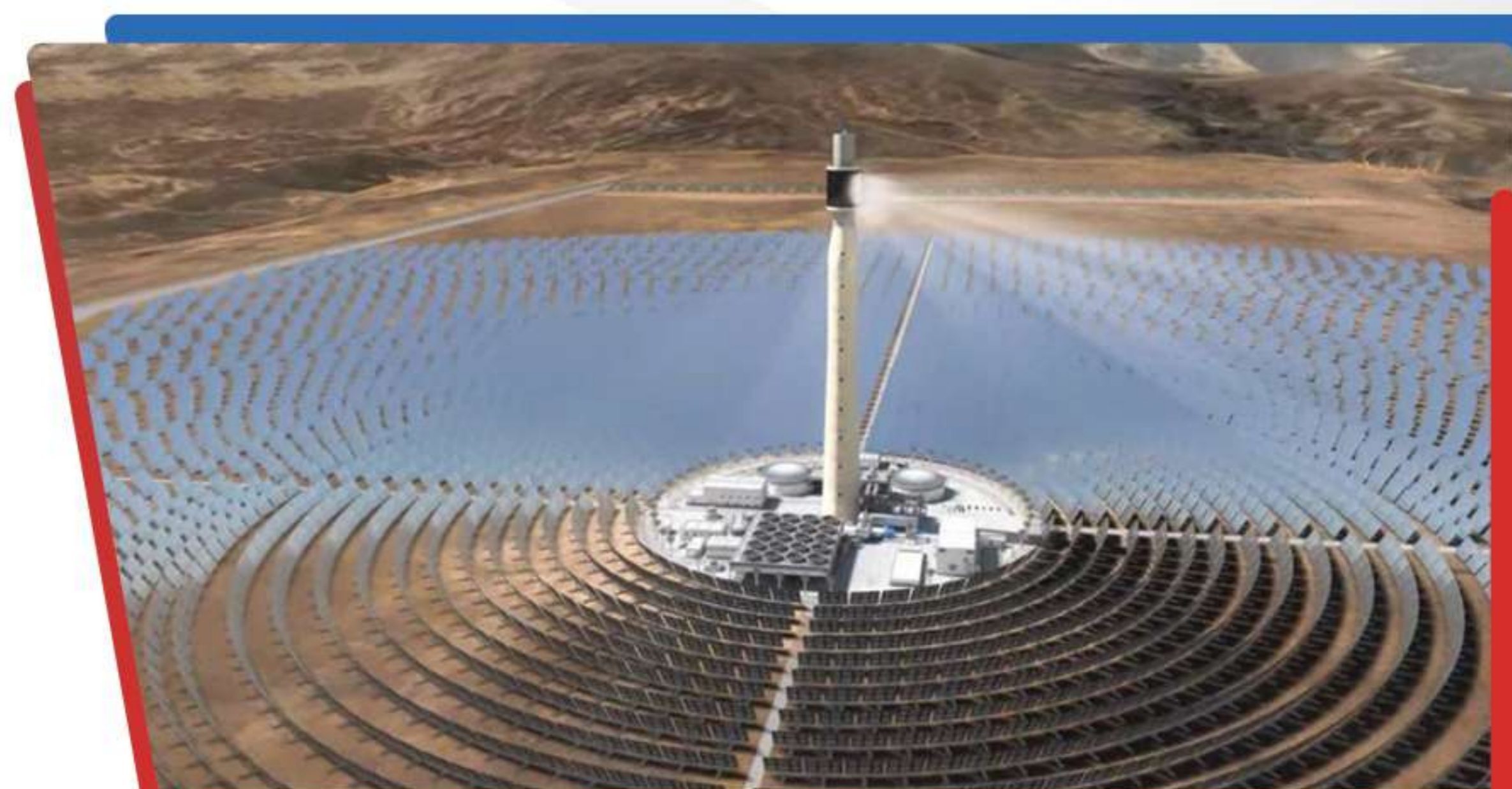
Noor Ouarzazate solar complex